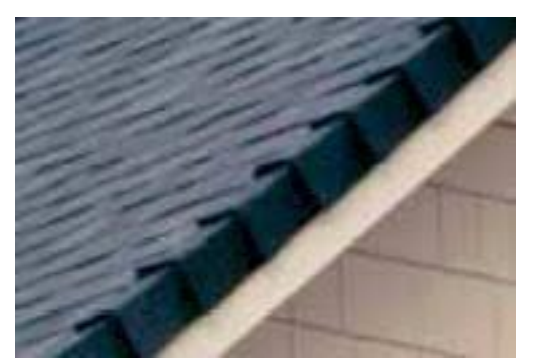
Ridge Glass on Gable Ends

Roofing material must be dark colored (e.g. Onyx black) architectural composition shingles, with gable ends finished with either (1) ridge glass consistent with other properties in the development or (2) multi-layer fascia with a drip edge.